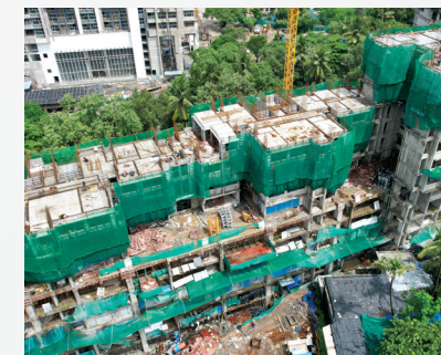
Wing A – 8th, Wing B – 9th, Wing C 12th floor work in progress.

Set in the tranquil heart of Sarvodaya Nagar, Mulund West, Arkade Nest is a thoughtfully designed residential retreat featuring six majestic towers soaring 22 storeys high. With premium 2 & 3 BHK homes and over 20 recreational zones across deck and ground levels, it offers a perfect balance of relaxation, recreation, and refined living.