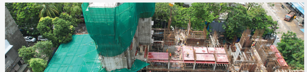
Wing G – 7th Slab Work in Progress

Maharera Registration No. P51800050953 Details available at https://maharera.maharashtra.gov.in/