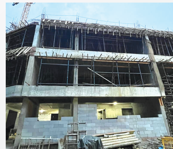
WING – A 2nd Slab Work Completed

Experience urban sophistication at Arkade Vistas, a towering 21 storey address in Jay Prakash Nagar, Goregaon East. Offering spacious 2 & 3 BHK residences, ample parking, and premium amenities like a tranquil swimming pool, an enchanting stargazing deck, and an outdoor screening area, this is where contemporary luxury meets ultimate convenience.