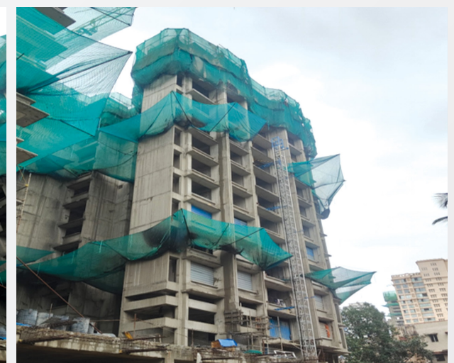
WING-B : 13th Slab Shuttering WIP

Maharera Registration No. P51800054908 Details available at https://maharera.maharashtra.gov.in/