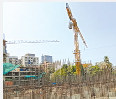
Wing C: 1st Podium Slab Work in Progress