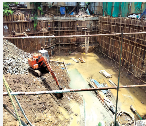
PCC for Foundation Work in Progress

Arkade Views, a magnificent 21 storey residential tower in Goregaon East, redefines urban living with thoughtfully designed 2 & 3 BHK homes. Nestled in the coveted Jay Prakash Nagar, it offers breathtaking views, seamless connectivity, and a lifestyle steeped in luxury. Experience the perfect blend of comfort, elegance, and convenience where every sunrise feels extraordinary.