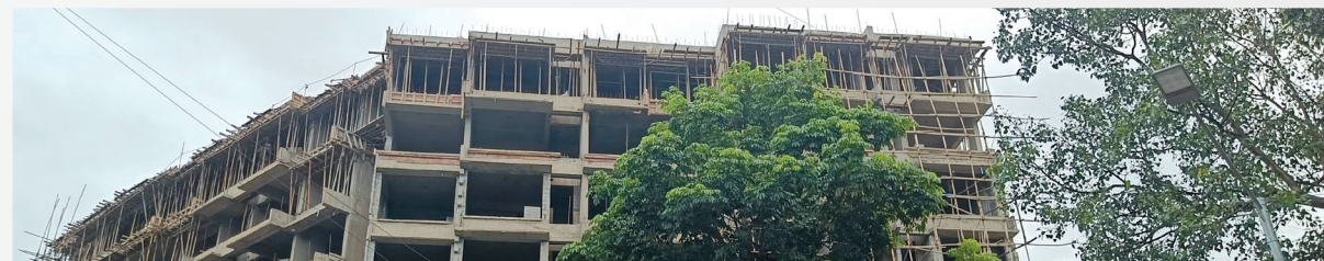
Wing – D: Terrace Slab Completed

Maharera Registration No. P51800077017 Details available at https://maharera.maharashtra.gov.in/