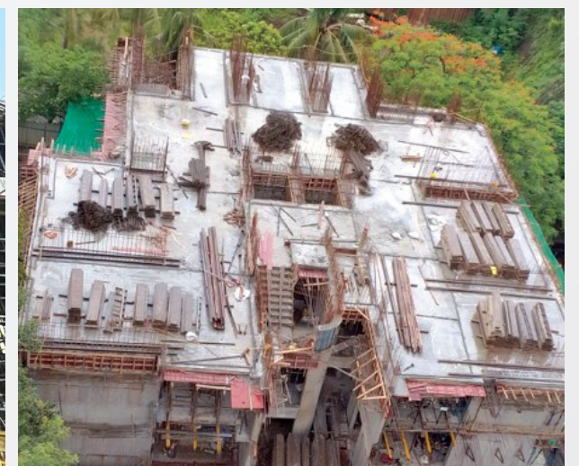
WING-B – 4th Slab Work Completed

Maharera Registration No. P51800077278 Details available at https://maharera.maharashtra.gov.in/