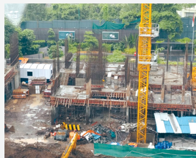
Wing - A & B 2nd Podium Slab Work in Progress

Arkade Rare, spread across 3 acres and comprising 7 impressive towers, is a magnificent 21-storey residential marvel in Bhandup (W). It offers exquisite 2 and 3 BHK flats designed to redefine urban luxury. Nestled off iconic LBS Road, this is your slice of paradise with breathtaking views, seamless connectivity, and unparalleled amenities. Experience modern living at its finest, where every moment is truly rare.