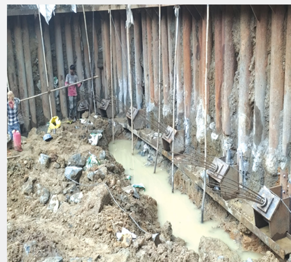
Rock Anchoring and Stressing for Shore Pile Work Completed

Maharera Registration No. P51800077304 Details available at https://maharera.maharashtra.gov.in/