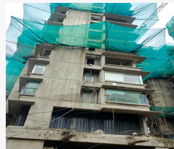
WING-A : 13th Slab Shuttering WIP

Nestled in Malad's prime locale near Sunder Nagar, Arkade Eden stands tall as a distinguished 21-storey tower offering luxurious 2 & 3 BHK homes. Designed for a seamless blend of comfort and sophistication, it features a spacious vehicle-free eco deck and a diverse range of amenities. Whether it's unwinding by the infinity pool, staying active in the modern fitness centre, or enjoying interactive spaces for all age groups, Arkade Eden redefines refined living.