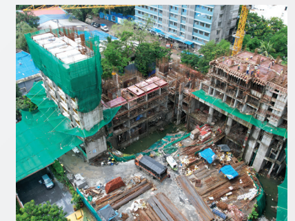
Wings D & E – 2nd podium, Wing F – 6th floor work in progress.