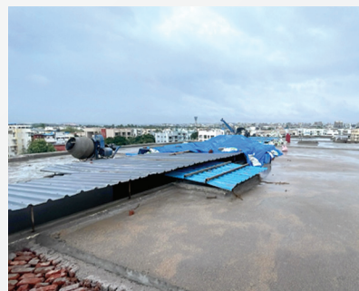
Wing – A & B: Terrace Level Waterproofing Work In Progress

Rising across 8 floors in Vile Parle, Arkade Pearl is a sanctuary of space, light, and nature on a sprawling 1-acre plot. Its 2 & 3 BHK residences are designed to offer seamless comfort and elegance, surrounded by lush greenery and open vistas. A well-equipped gym, soothing reflexology area, and an opulent banquet hall complete the picture of refined living. Discover a home where luxury meets serenity.