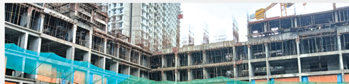
Wings D, E, F, and G: 6th Slab Work In Progress

Maharera Registration No. P51800077307 Details available at https://maharera.maharashtra.gov.in/