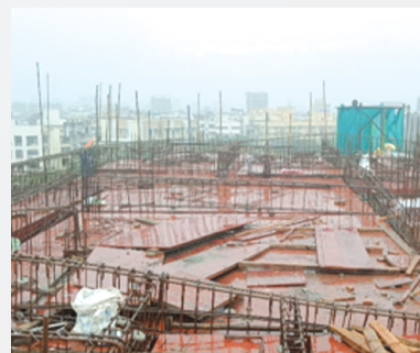
Wing- C & E: Terrace Slab Decking Work In Progress