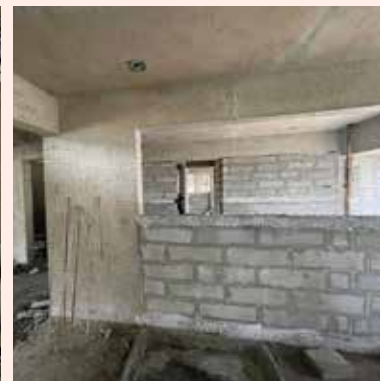
Wing- A & B: 4th Floor Blockwork - WIP