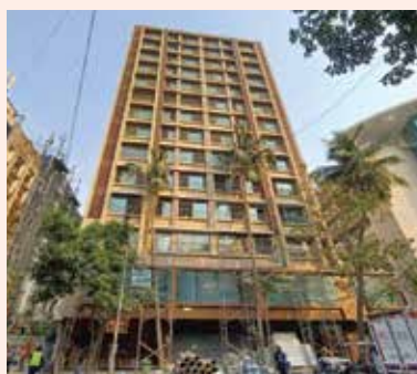
Wing - A Front View

Set in Malad's prime location near Sunder Nagar, Arkade Eden is set to be a standout 21-storey tower offering luxurious 2 & 3 BHK homes. It will feature a spacious vehicle-free eco deck and a range of amenities designed for every age group, from an infinity pool and a contemporary fitness center to engaging interactive areas and a serene space dedicated to senior citizens.