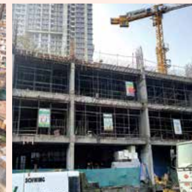
Wing - B: 3rd Podium Slab Casting - Work Completed