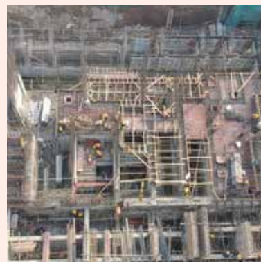
Wing F – Plinth Slab and STP - WIP

Maharera Registration No. P51800077307 Details available at https://maharera.mahaonline.gov.in