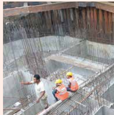
Wing-A & B : UCWT Plum Concreting - WIP