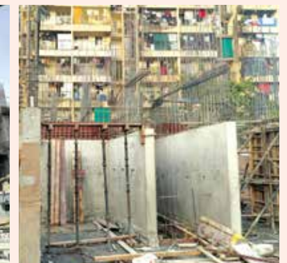
Wing - C: 4th Podium Slab - WIP

Maharera Registration No. P51800054195 Details available at https://maharera.mahaonline.gov.in