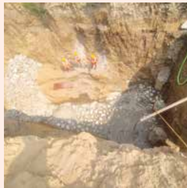
Wing-B : Open Foundation Rich PCC- WIP