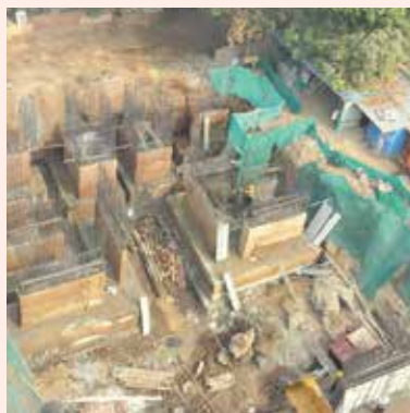
Wing - A & B: Plinth & Column - WIP

Arkade Rare, a magnificent G+21-storey residential marvel in Bhandup (W), offers exquisite 2 and 3 BHK flats designed to redefine urban luxury. Nestled on the iconic LBS Road, this is your slice of paradise with breathtaking views, seamless connectivity, and unparalleled amenities. Experience modern living at its finest, where every moment is truly rare.