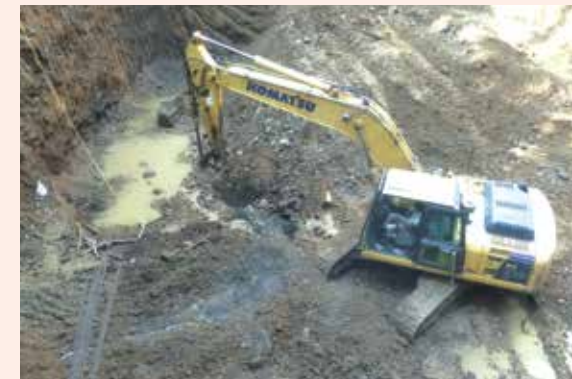
Excavation - WIP