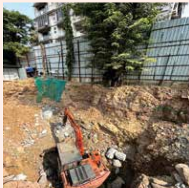
Wing-A : Excavation for Open Foundation - WIP

Arkade Views, a stunning 17-storey residential project offering 2 & 3 BHK flats in Goregaon East, is your slice of paradise on earth. Enjoy breathtaking views, unmatched connectivity, and luxurious living in the prestigious neighbourhood of Jay Prakash Nagar. Experience modern living at its finest.