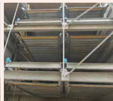
Car Parking - WIP