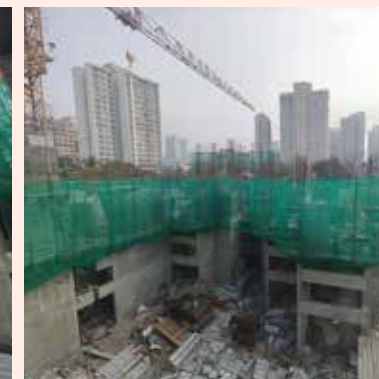
Wing - B : 3rd Slab Shuttering - WIP