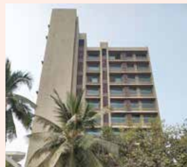
Wing - B: Back Side View