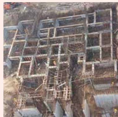
Wing E – Plinth - WIP