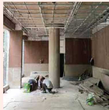
Multi-Purpose Hall & Fitness Center - WIP