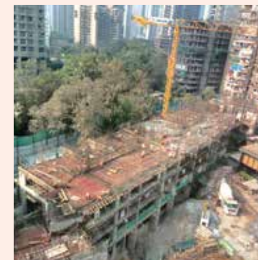
Wing A: 3rd Podium Slab Reinforcement - WIP