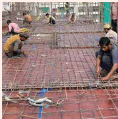
Wing - A & B: 8th Floor Slab - WIP

Arkade Nest, situated in the peaceful Sarvodaya Nagar of Mulund West, features six towers, each rising to G+ 22 storeys. Offering premium 2 & 3 BHK homes, future residents will enjoy access to over 20 recreational zones across deck and ground levels, promising a lifestyle rich in leisure and luxury.