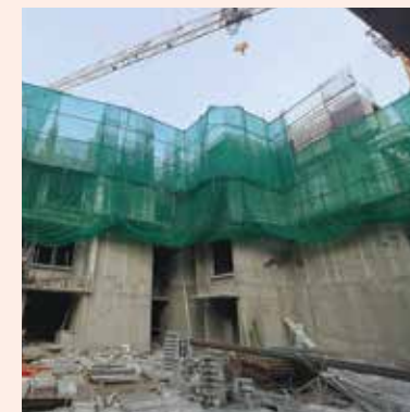
Wing - A : 4th Slab Shuttering - WIP