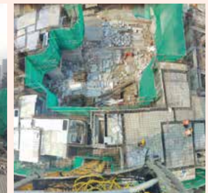
Wing - A & B Top View

Maharera Registration No. P51800047081 Details available at https://maharera.mahaonline.gov.in